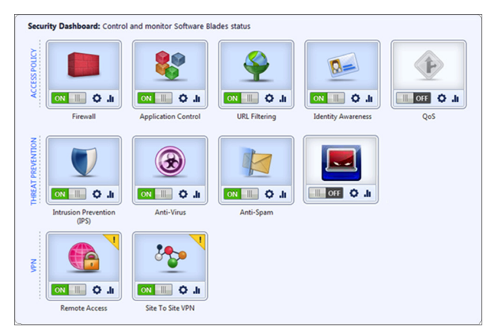
Easy and Intuitive Local Management

A simple Web-based management interface allows administrators to secure a small business in minutes. The setup wizard enables a pre-set security policy. Customize the device configuration and security policy with the web-based management interface. Monitor the device and security with easy-to-understand logs and reports.