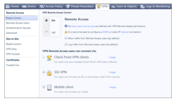
VPN Configuration for 1100 Appliance

Ensure secure communications between site-to-site and remote users with IPsec and SSL VPN. Offering multiple connectivity methods (including Check Point's VPN clients, SSL and mobile clients), The 1100 Appliances ensures secure connectivity wherever you go.